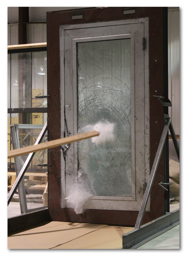
Winco tornado and impact testing: Winco architectural-grade preglazed windows, incorporating Tremco's Spectrem 2 Silicone Sealant and 440 Tape, were tested for tornado and impact resistance.

communications center and emergency management section all under one roof to further enhance the communications channels. These functions had been housed in separate facilities with no connection to other participants in the emergency communications process. Two of the facilities were not secure and one was located in a nuclear fallout shelter which was well past its useful life. To make matters worse, this area is a high seismic zone.