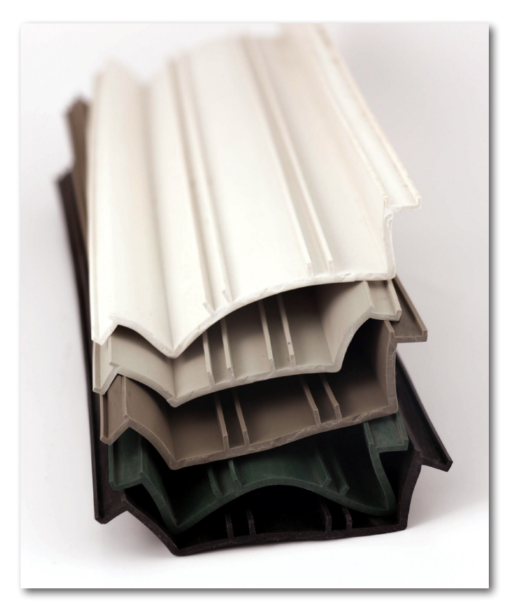
The patented design of the Spectrem Restoration Overlay provides an easy-to-install, aesthetically pleasing, durable solution to restore weather-tightness to skylights, glass paneled roofs, sloped glazing systems, pressure bar and zipper/lockstrip gasket systems.

Before long, Hyatt Regency Cincinnati also began using the silicone extrusion overlay system and it has been used to provide critical protection in other environmentally sensitive institutions including museums and medical treatment centers. For these Hyatt hotels, it has ensured that the lobbies with skylights add to the experience when a visitor enters the hotel, bathing the area in sunlight by day or adding to the ambiance with