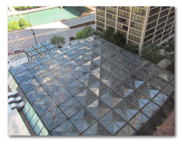
Expansion and contraction from changing weather conditions throughout the day and night on this skylight over an atrium lobby at Hyatt Regency Chicago began to take its toll on glazing seals, creating the potential for leaks along the framework of the glass.