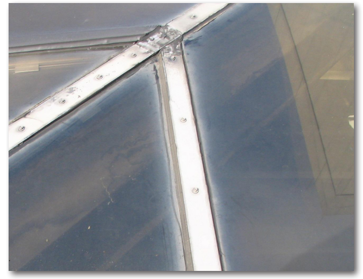
Recaulking over the years had not stopped the leaks and left a slightly messy appearance. Installation of the patented silicone gasket overlay system over the upper left portion of the skylight framework provided a clean appearance while eliminating potential for leaks.